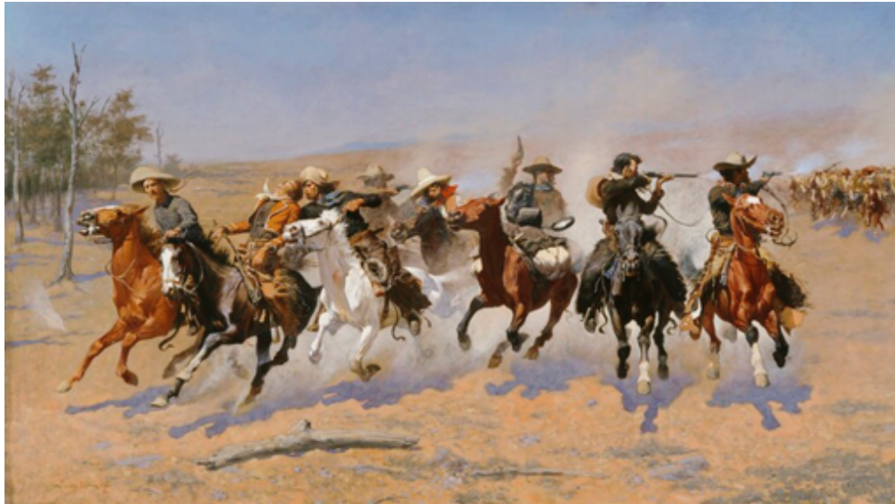
Frederic Remington. A Dash for the Timber . 1889.

Invigorating talk about historical myths in art that live with us today.