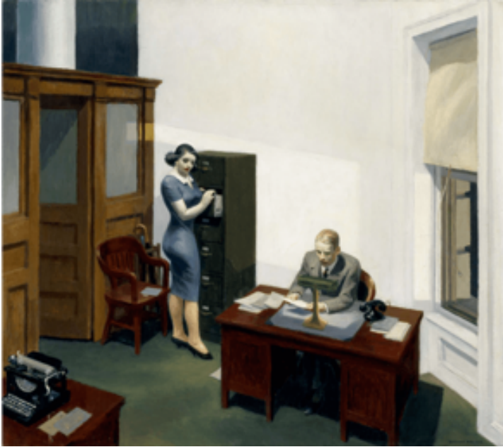
Edward Hopper. Office at Night . 1940.

Captivating talk about American work life from the unusual perspective of a superstar artist