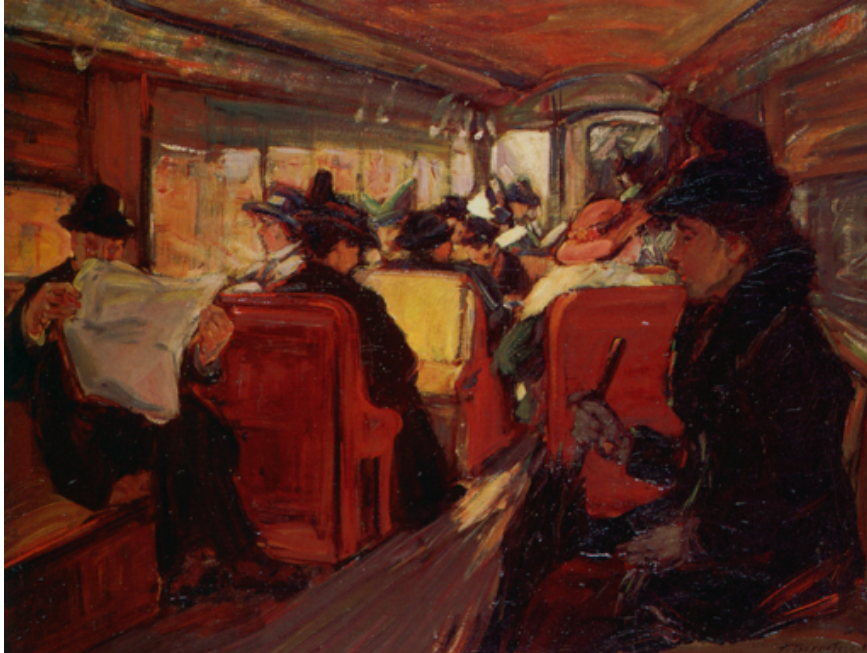
Theresa Bernstein. In the Elevated . 1916.

Relevant talk about American women's history through the eyes of women artists