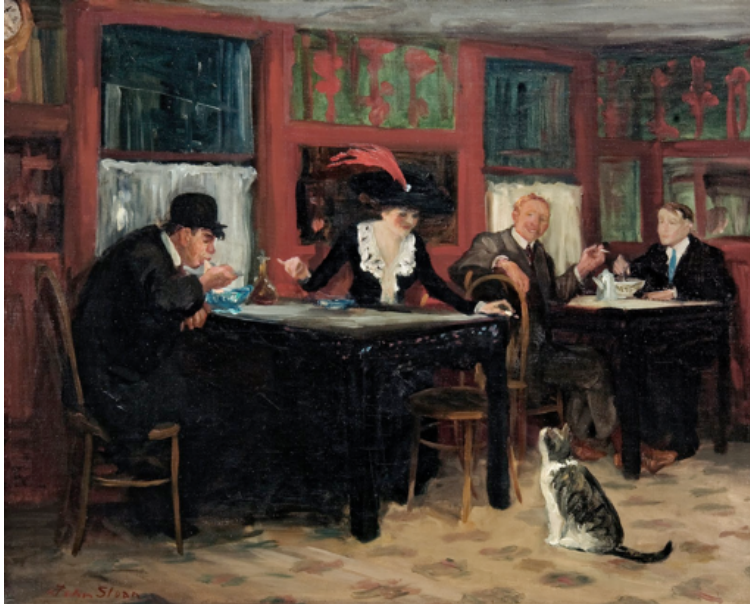
John Sloan. Chinese Restaurant . 1909.

Lively talk about New York City artists showing us a great time in the city, 1900-1950