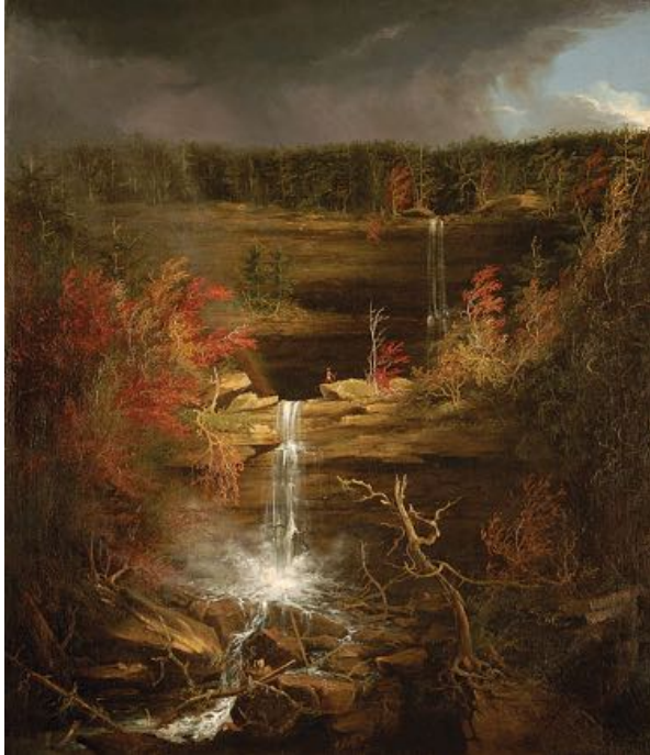
Thomas Cole. Kaaterskill Falls . 1826.

Eye-opening talk about the Hudson River School and how landscape art swayed the nation.