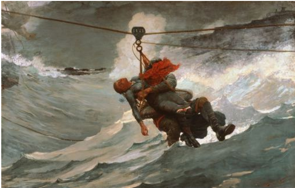
Winslow Homer. The Life Line . 1884.

Timely talk in conjunction with the Metropolitan Museum of Art exhibit April-July 2022