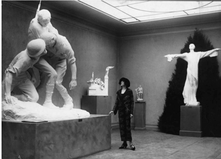
Gertrude Vanderbilt Whitney with her sculptures, including "Impressions of War," 1919.

Empowering talk about women artists who reinvented their lives, changing the art world forever.