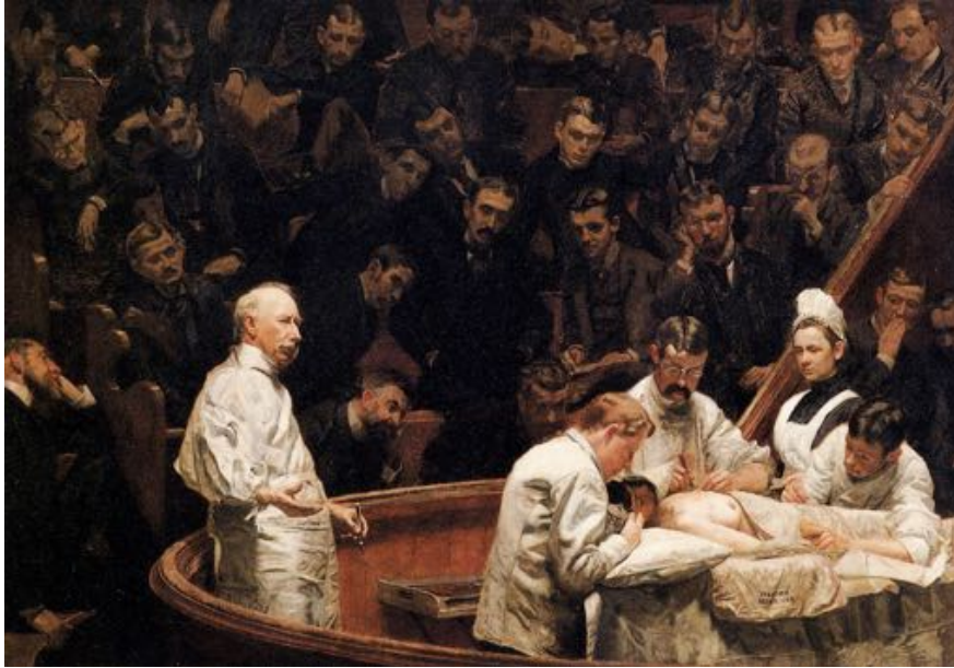
Thomas Eakins. The Agnew Clinic . 1889.

Fascinating talk about American work forever marked by this era of radical change.