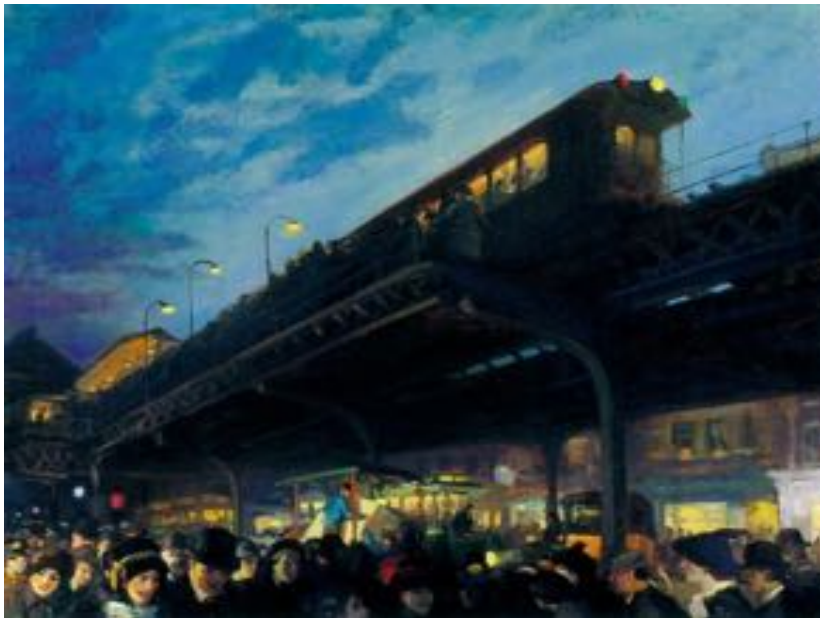
John Sloan. Six O'Clock Winter . 1912.

Want something fresh and different for your next Corporate event? Think art!