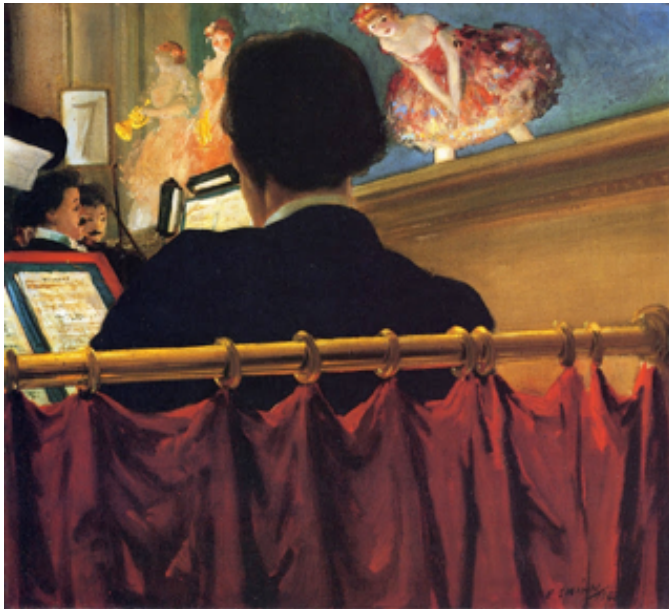
Everett Shinn. The Orchestra Pit . 1906-07.

Take a fresh look at New York City through the eyes of some of America's greatest artists who were endlessly inspired by the city. Ready for a night on the town? How about vaudeville? The movies? Or the spectacle of urban theater on the streets. It's all here in full color as these artists showcase the glamour, grandeur, and grit of New York. Be delighted by the new urban scene with its technological wonders, new palaces for entertainment, and everyday pleasures of a growing, bold, optimistic city.